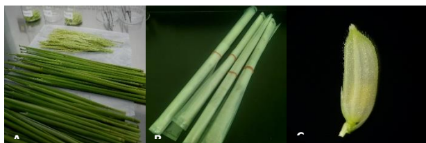
Figure 1. (A) Harvested panicles that will be pretreated with cold temperature; (B) Panicles that have been wrapped in wet tissue and wrapped in plastic; (C) Position of anther that does not exceed half the length of the grain