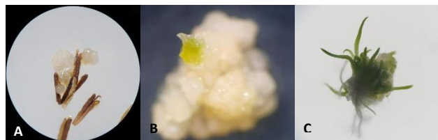
Figure 2. (A) Callus formed from anther explants; (B) Green callus; and (C) Green plantlets.

The total green plantlets produced by 8°C pretreatment are more when compared to 4°C pretreatment (Fig. 3D). Each genotype produced green plantlets with various amounts. The RCKJ 04 genotype produced the highest number of green plantlets compared to the other six genotypes, with 62 green plantlets (Fig. 4A-B).